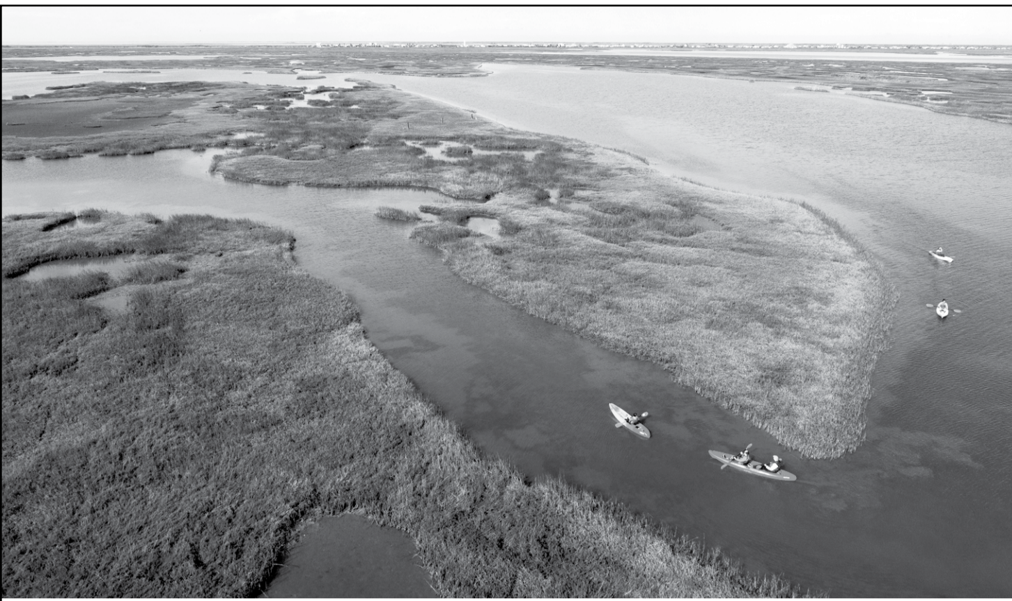
The Lower Colorado River Authority has donated a conservation easement to protect hundreds of acres of Matagorda wetlands from future development. Pictured are some of the protected wetlands at LCRA's Matagorda Bay Nature Park. (Submitted Photo)