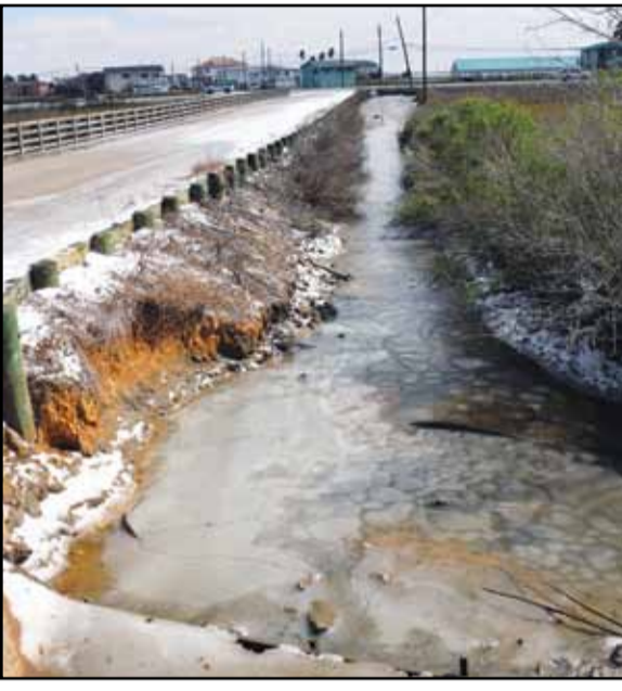
THE marsh areas along Perryman Ave. were dusted in snow and nearly frozen solid during last week's frozen winter weather event.