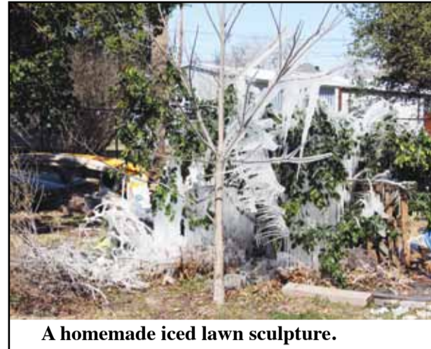
A homemade iced lawn sculpture.

WEDNESDAY FEB. 24, 2021 VOL. 114 • NO. 8