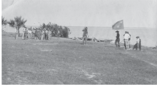
LaSalle's Landing Reenactment, 1924.

Love History and Role-playing? Come and be a part of the LaSalle's Landing Reenactment taking place at the Lion's Club 4th of July Celebration at East Bay Park at 6 p.m. We are looking for people of all ages to be part of LaSalle's crew and the Karankawas. If anyone has canoes and can help build a hut, please contact the museum. We do have costumes and scripts available. For those interested, please email the museum at museumpalacios@gmail.com or call us at 361-972-1148. We are open Tuesday- Friday from 12:30 to 5:30 pm and on Saturdays from 10 to 2 pm.