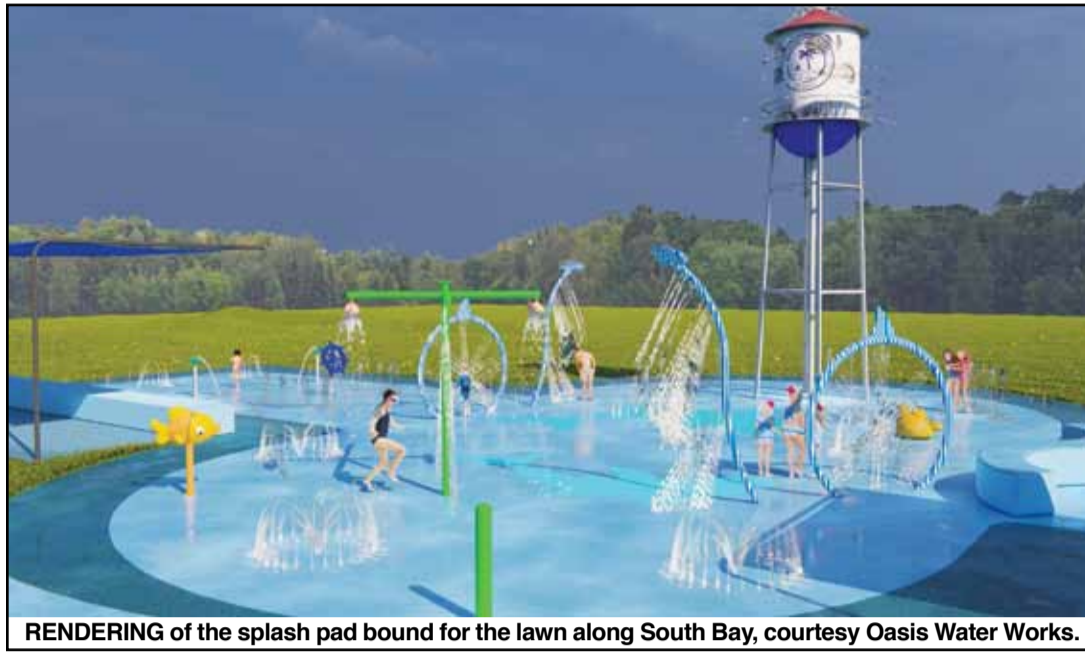
RENDERING of the splash pad bound for the lawn along South Bay, courtesy Oasis Water Works.

WEDNESDAY OCT. 30, 2024 VOL. 117 • NO. 44