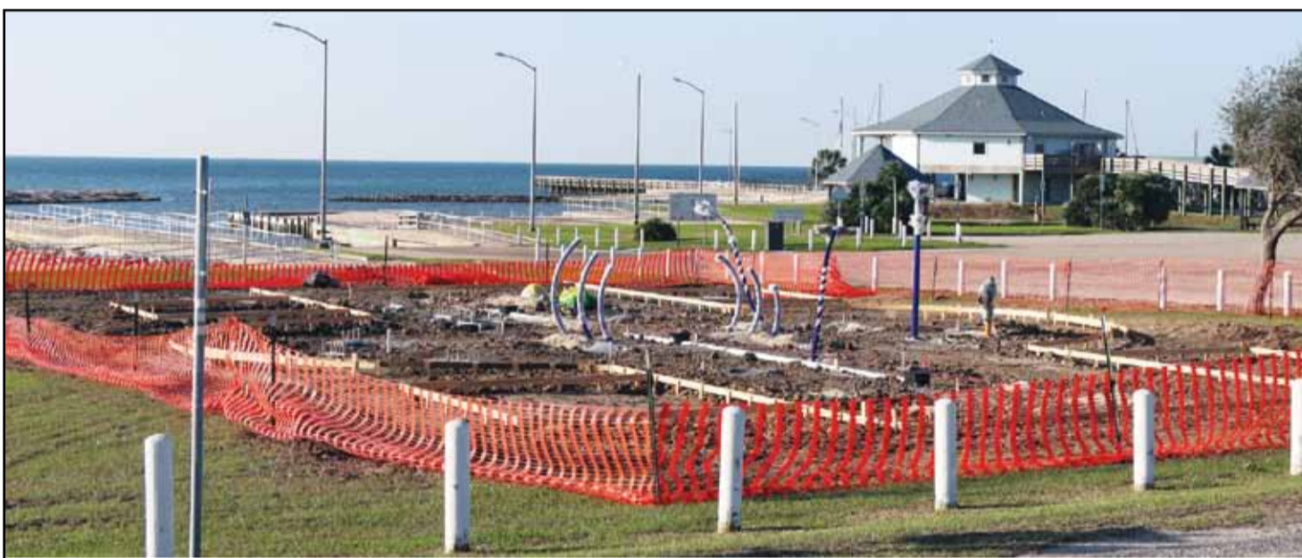
THE form is being framed out and a few of the featured attractions are mid-installation as the construction on the splash pad in the 500 block of South Bay Blvd. The project was funded through a grant from the Matagorda Bay Mitigation Trust.